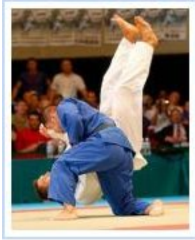
Action from the 2003 World Judo Championships.