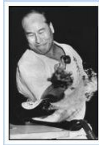
Mas Oyama (1924-94), founder of Kyokushinkai. Mas Oyama (1924-94), founder of Kyokushinkai.

A: There are many different styles of karate, each with its own emphasis and characteristics. For example, styles such as Wado-ryu and Shito-ryu are characterised by light, fast movements while styles such as Goju-ryu and Kyokushinkai are typified by heavy, strong techniques. Shotokan lies somewhere in the middle with elements of both light and heavy styles. The main focus of Shotokan is learning, through correct technique, how to use your body to generate as much power as possible as efficiently as possible, and then using this power to apply defensive and offensive techniques (particularly those from the various kata) against an attacker.